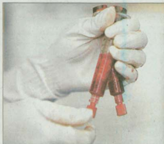
Two syringes contain fat removed from the chin of the patient.

With the oft-dreaded swimsuit season upon us, plastic and dermatologic surgeons see a spike in the number of patients asking about liposuction, a surgical procedure that removes fat deposits and re-