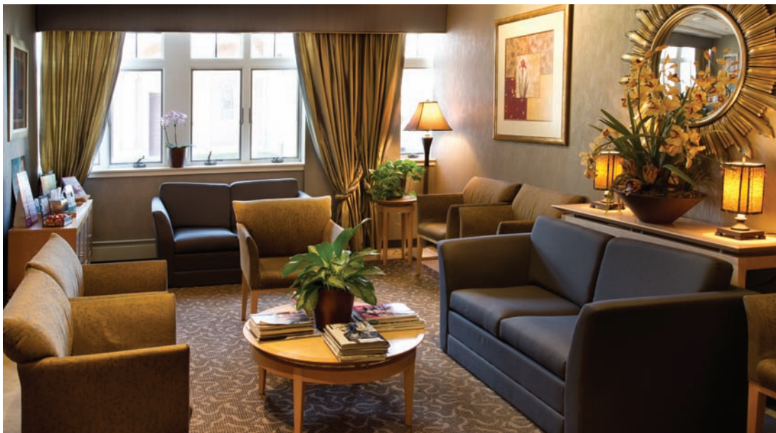
The reception area embodies comfort and style.

Clearly, this is more than just good customer relations. It's good medicine. And good medicine is what you would